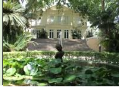
Noche Del Vino